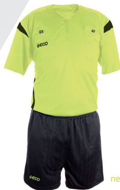
neon yellow-grey grey

Velcro closing on chest and pockets 100 % Polyester