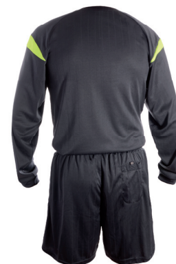
grey-neon yellow grey