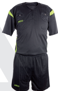
grey-neon yellow grey